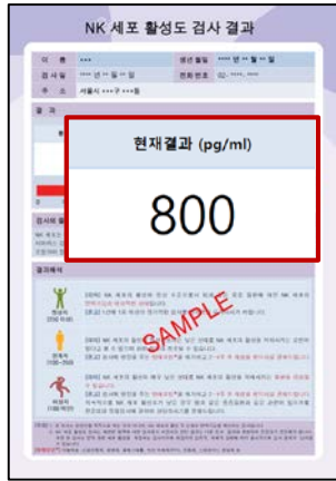
NK Cell Activity Test (NK Vue® Kit)